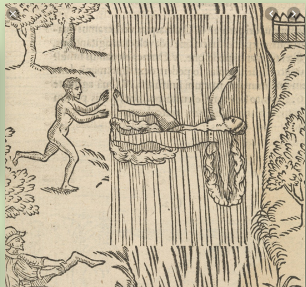
Etching from 'The Art of Swimming' , Everard Digby 1587