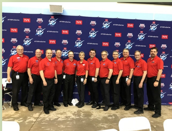
PVS Officials - 2019 TYR Pro Series

Images used are public domain or printed with permission.