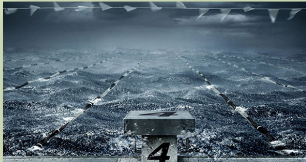
Circa 2009 (est.), Unknown