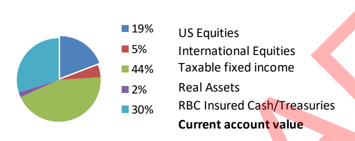
As of 31 May 2024 ASSET ALLOCATION SUMMARY

Our investment portfolio managed by RBC Wealth Management continues to exceed our growth target, outperforming the MSCI All Country World Index and earning 3% or greater, net of fees. A point of information is that we transferred $500,000 from our Wells Fargo account into a higher earnings opportunity, specifically, a Treasury Money Market fund managed by RBC Wealth in late April. This is the prime driver for the change in the portfolio's balance.