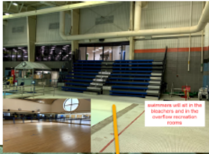
swimmers will sit in the bleachers and in the overflow recreation rooms