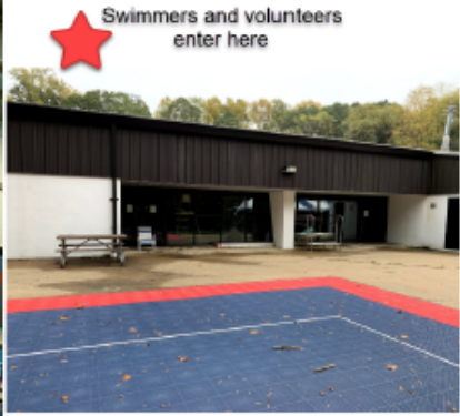
Swimmers and volunteers enter here