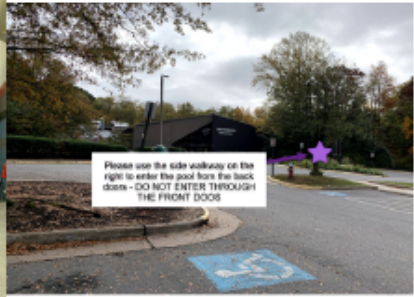
Please use the side walkway on the right to enter the pool from the back door - DO NOT ENTER THROUGH THE FRONT DOOR